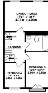
1ST FLOOR 442 sq ft. (41.1 sq m.) approx.